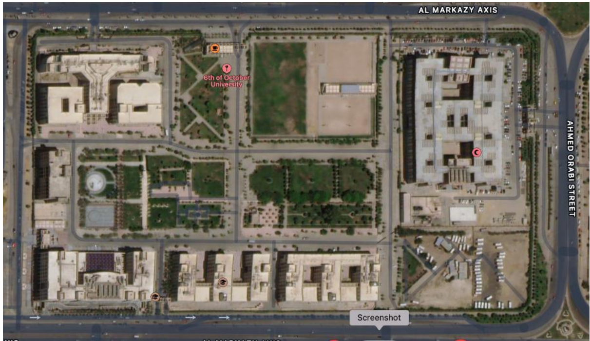
7). Defined Barking areas