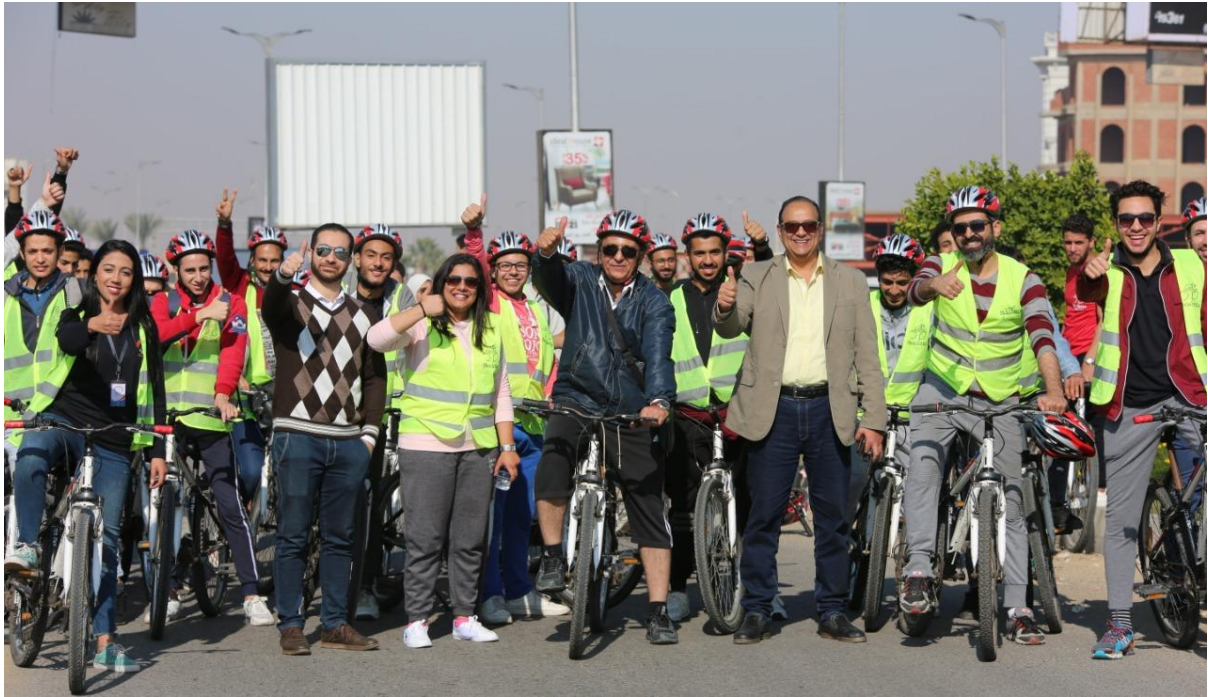
2) Encourage students to use bicycles.