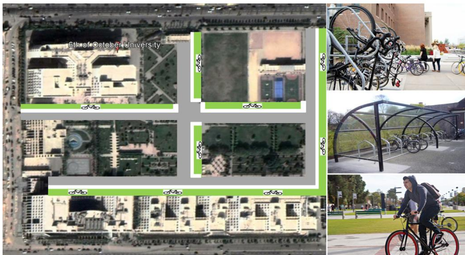
3) Partially applied plan to add bicycle stations on campus (images on right from web).

1- استخدام الدراجات داخل الحرم الجامعي للطلبة و العاملين للتنقل بين المباني داخل الجامعة مع اماكن خاصة للدراجات عند كل مبنى.