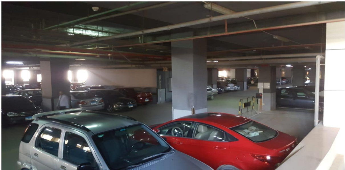
1) two storey underground parking