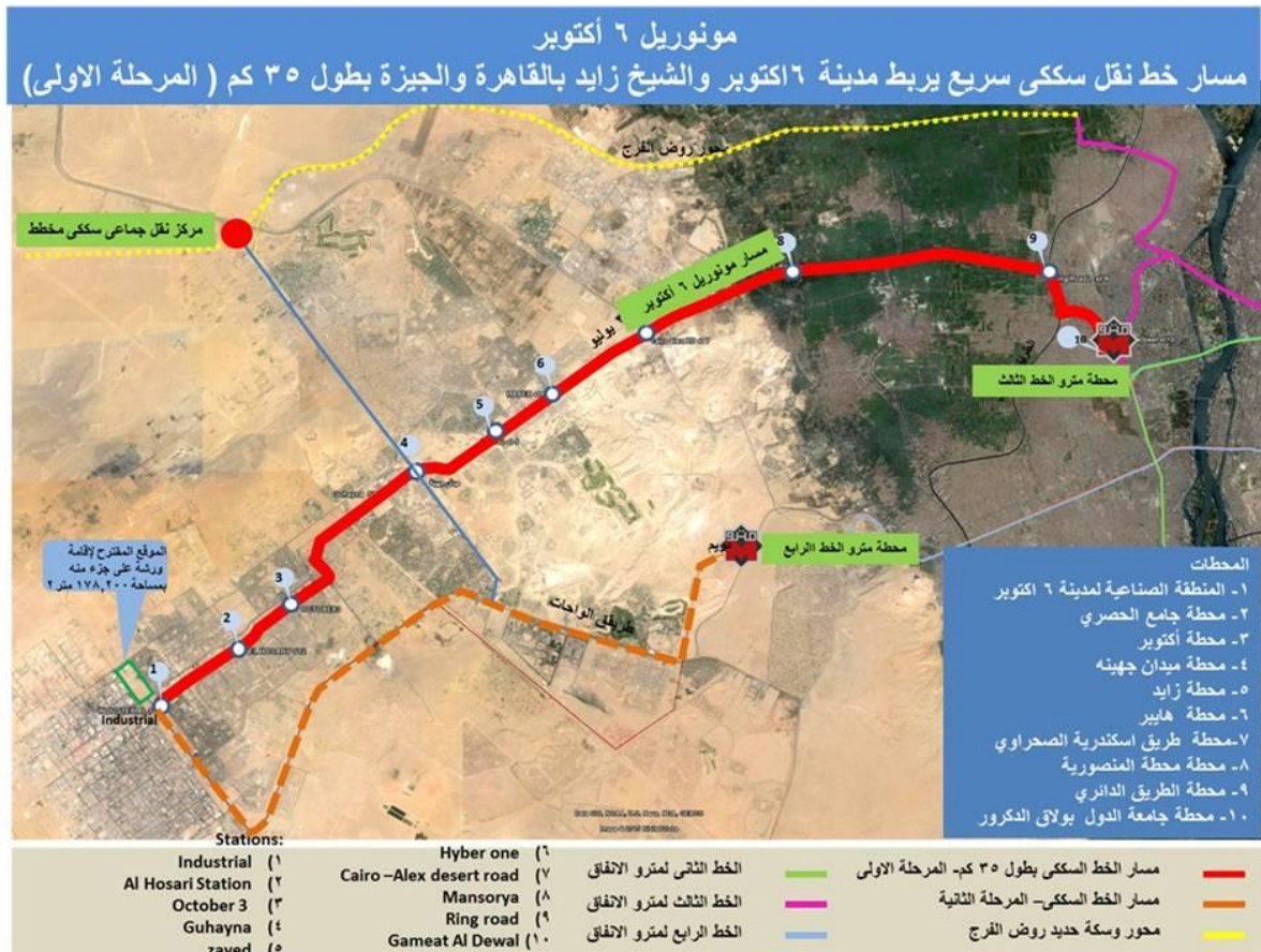
6) The Egyptian government plan to construct metro line beside the university (80 % finished)