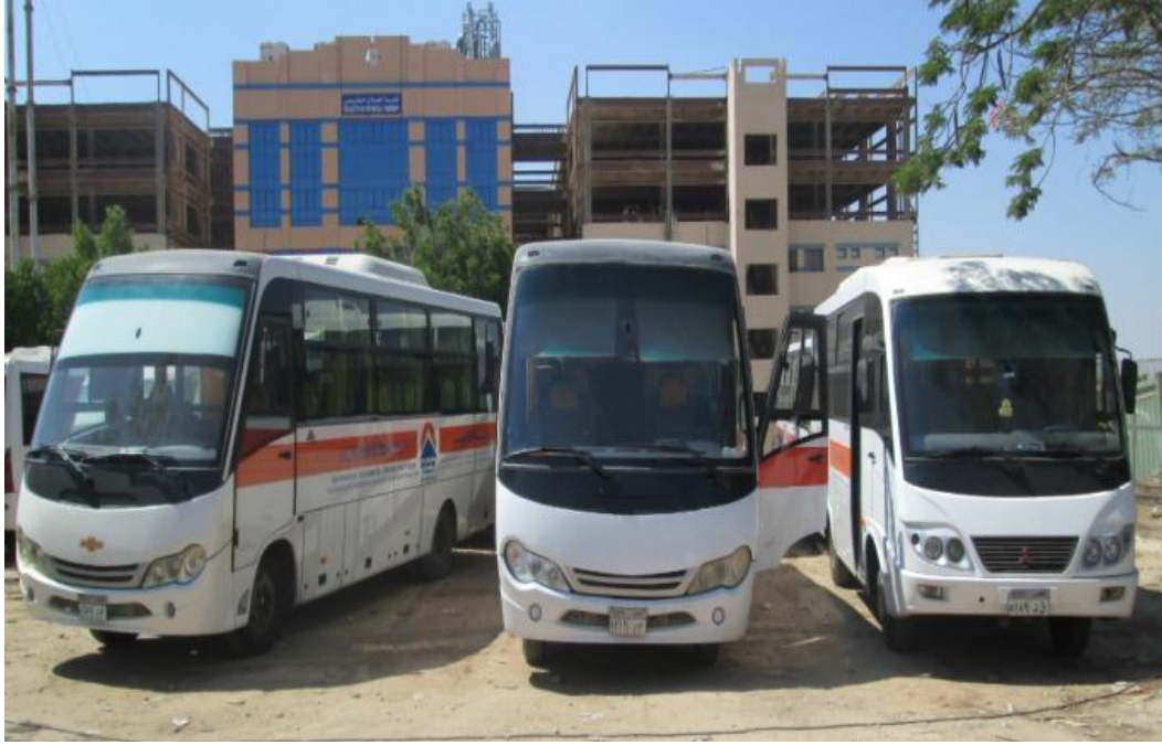
4) Buses to transfer students, staff and employees to and from the university to decrease individual transportation.