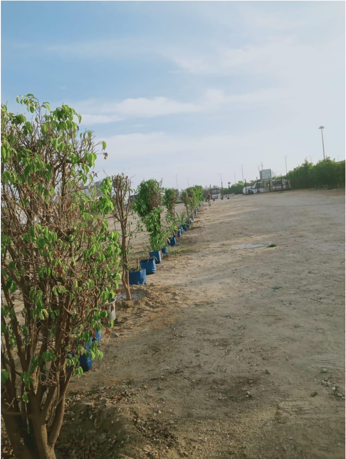
9) Trees in the parking area to limit the spaces by green trees.