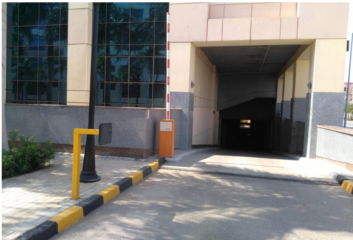
8) Limiting parking area.