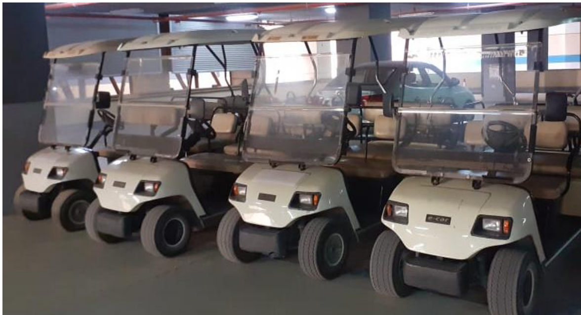
5) Electric golf cars that used inside the campus to transfer students and staff