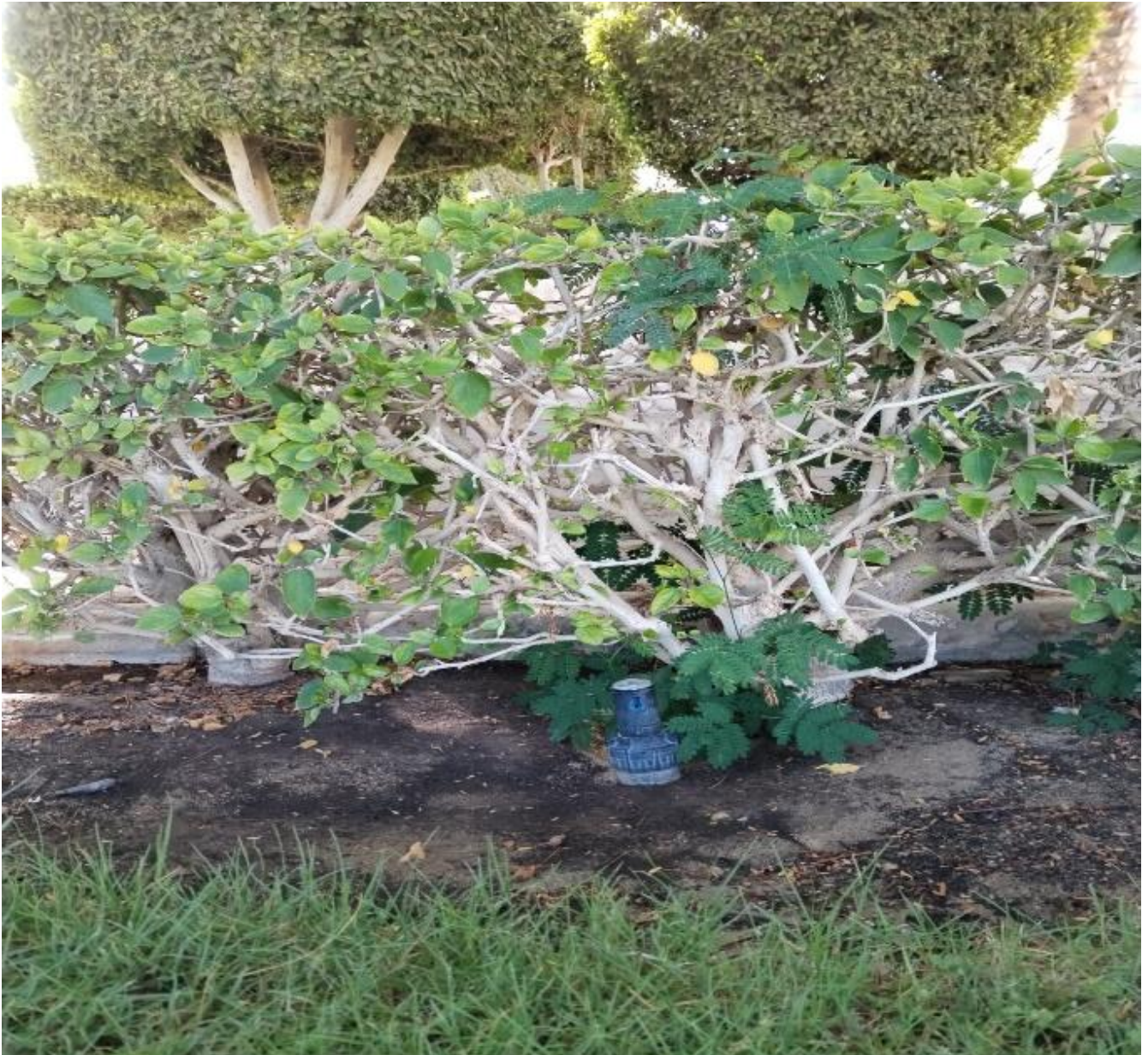
Fig.1. Smart controlled system for plants watering