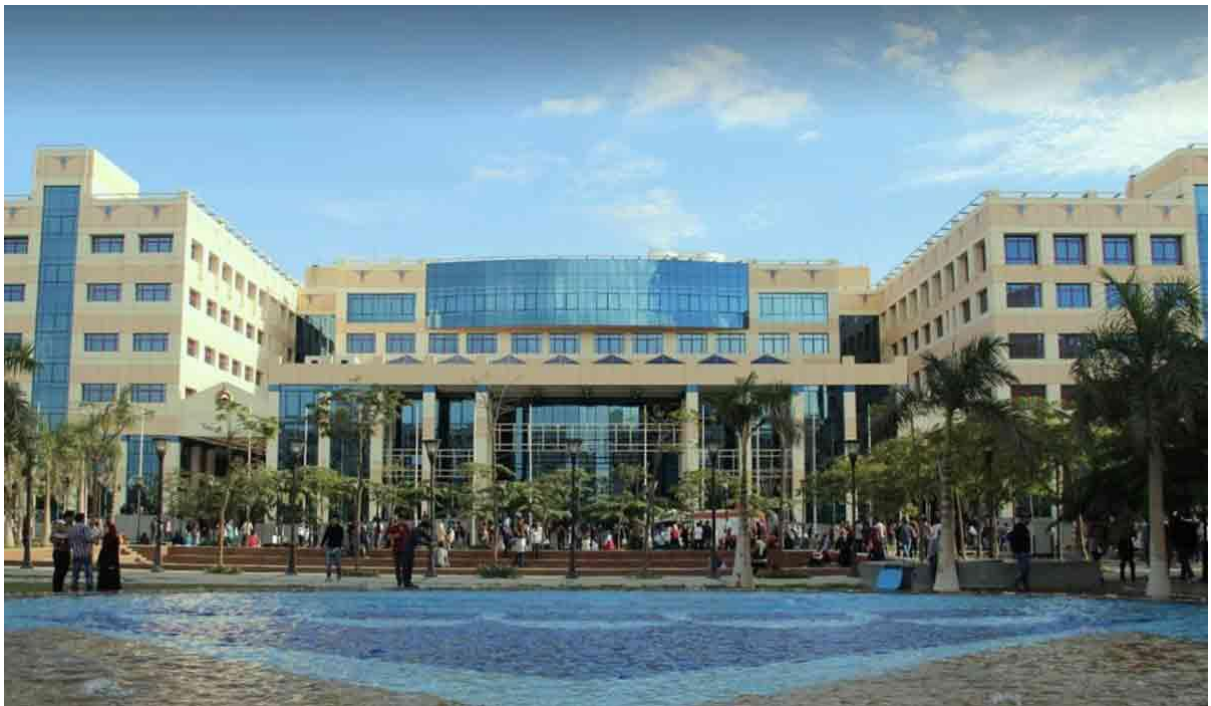
Fig.7. The large water reservoir besides the administrative building (277 m 2 ).