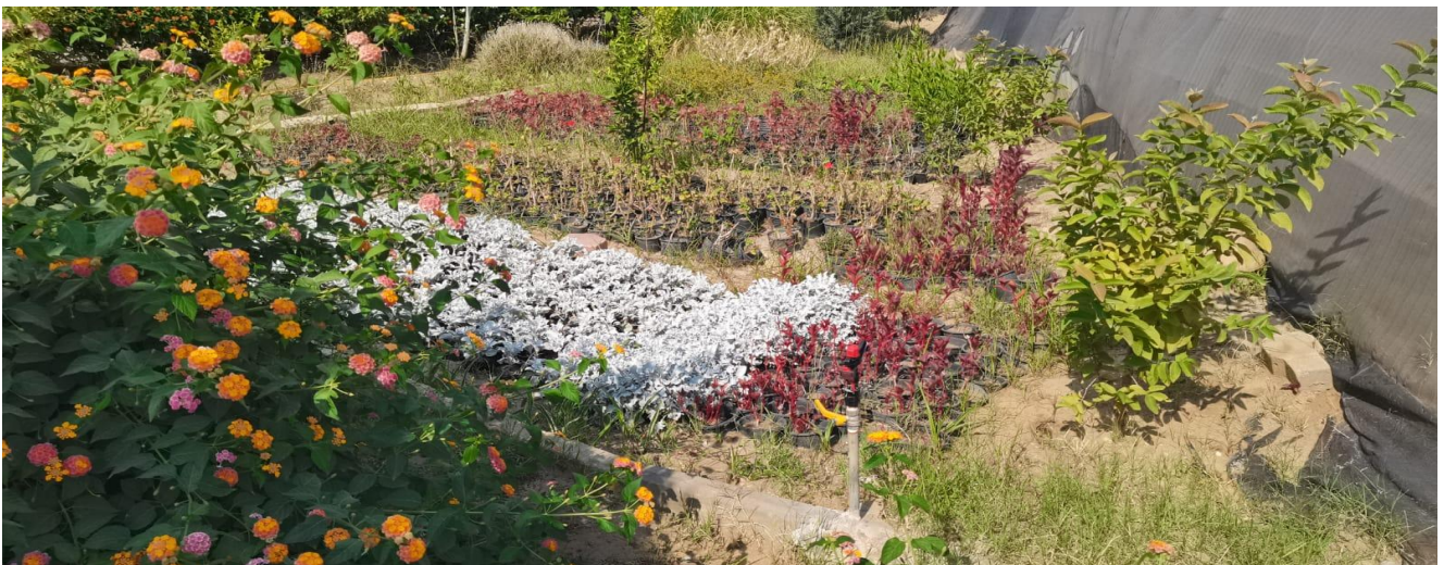
Fig.8. Green houses for water conservation.