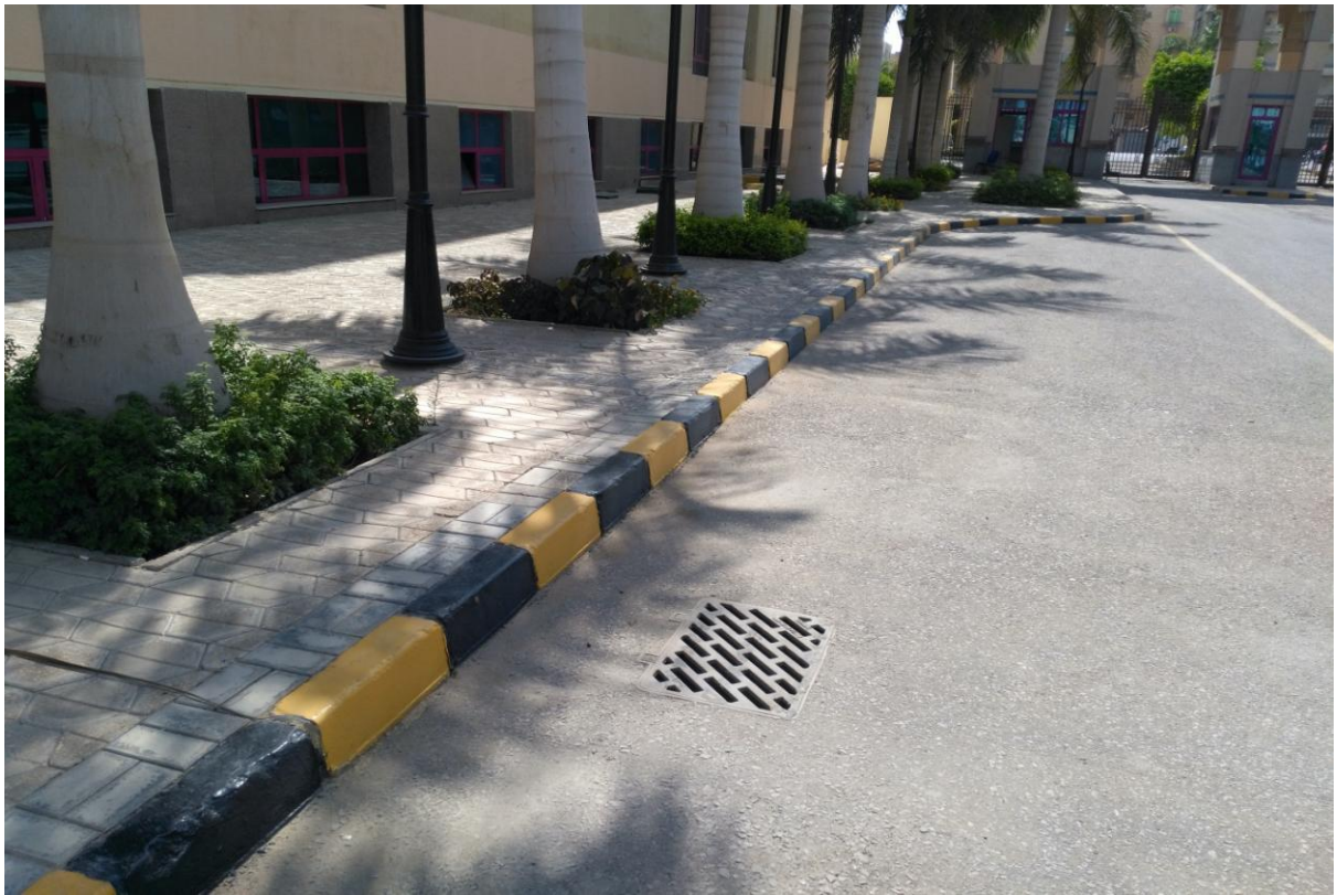
Fig.10. Rainwater and wastewater collection system. Sewage system for collecting rainwater in ground main water tank for rainwater collection.