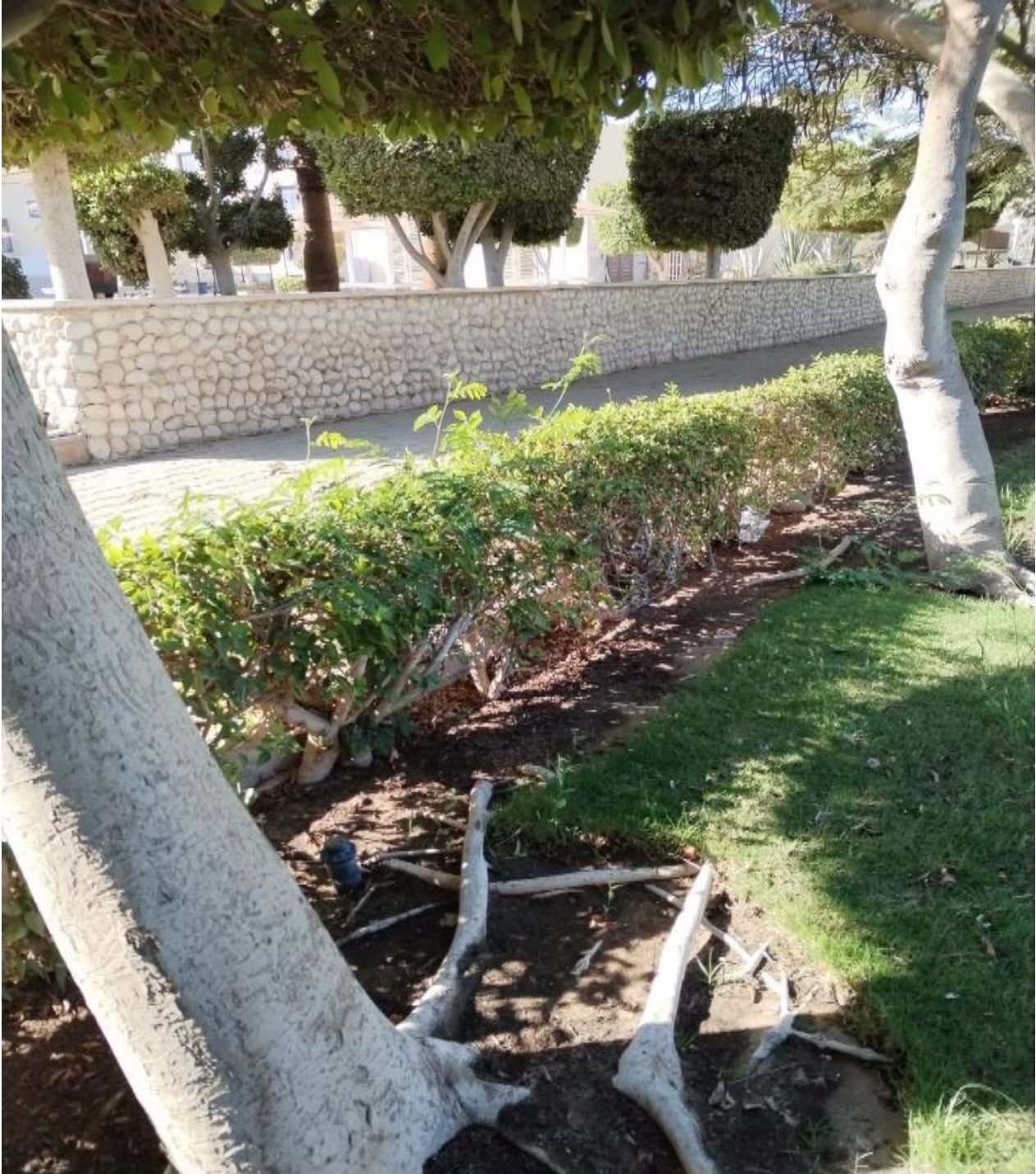
Fig.2. Example of Consumption of treated water