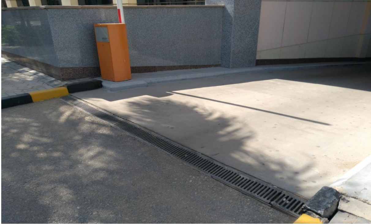
Fig.9. Channels (drains) to collect water.