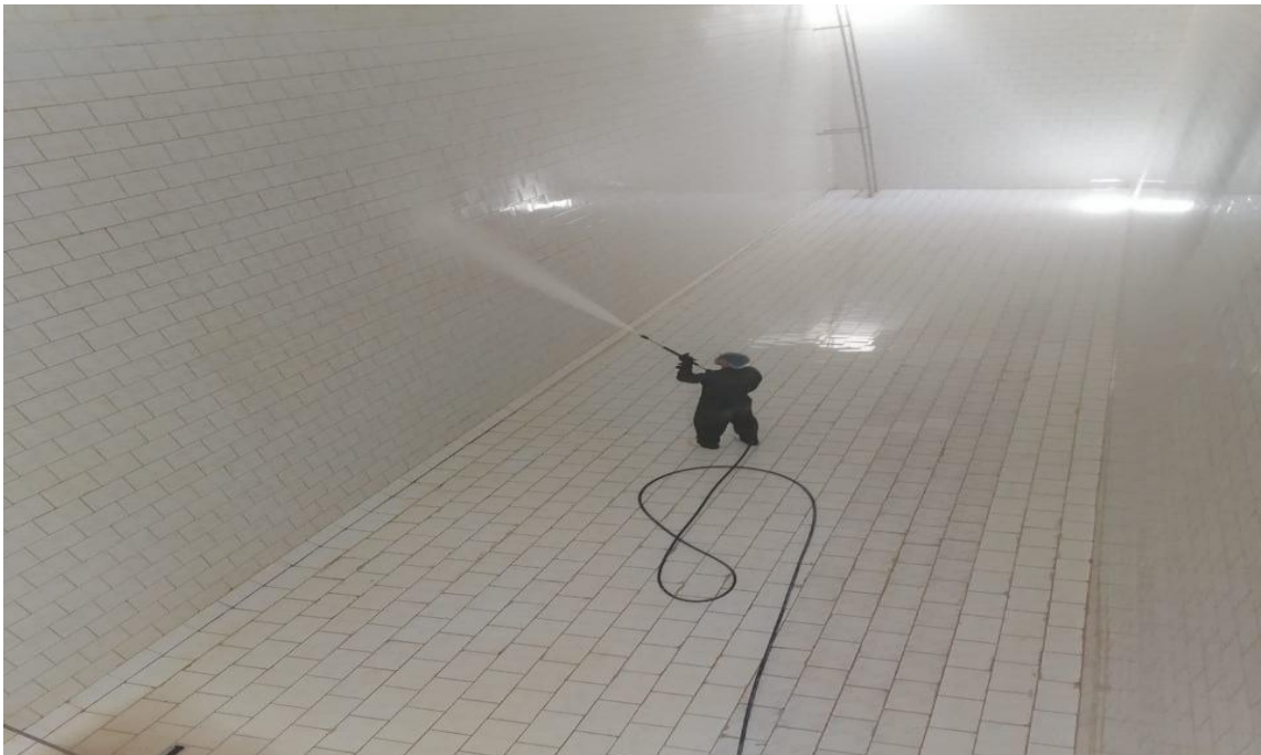
Fig 4: Underground water reservoir

Fig.3. Conservation that been adopted by the Egyptian government as a national project toward saving the irrigation water through water canal lining to decrease the loss of water. As it expected to save 5 billion cubic millimeter of the water needs for agriculture purposes.