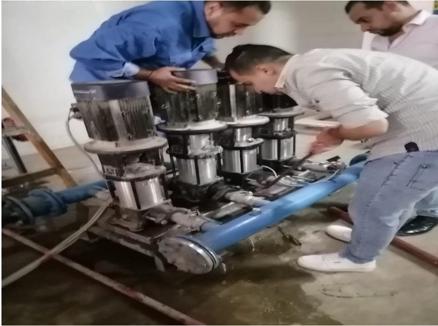
Fig 6: Water filters