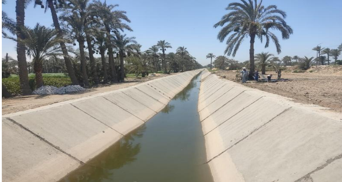
Lining irrigation canals تبطين الترع

Fig.3. Conservation that been adopted by the Egyptian government as a national project toward saving the irrigation water through water canal lining to decrease the loss of water. As it expected to save 5 billion cubic millimeter of the water needs for agriculture purposes.