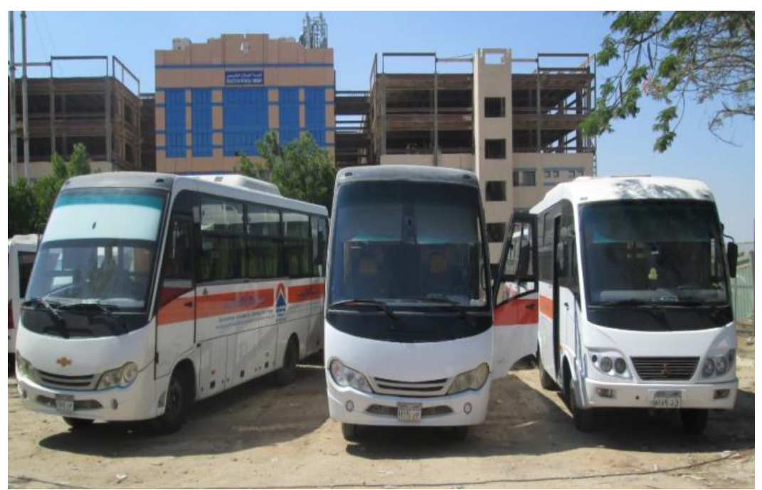
4)Buses to transfer students, staff and employees to and from the university to decrease individual transportation.