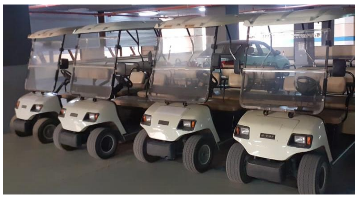
5) Electric gulf cars that used inside the campusto transfer students and staff