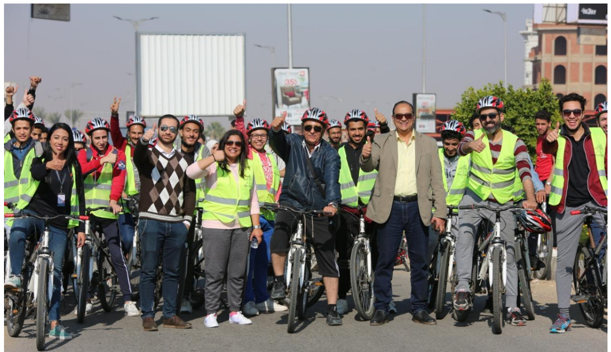
2) Encourage students to use bicycles.