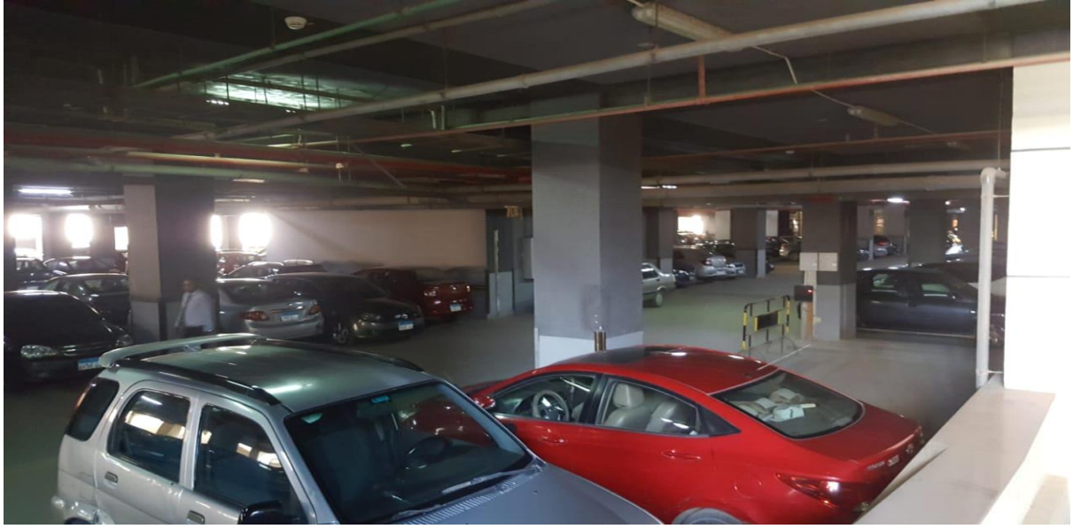
1) two storey underground parking