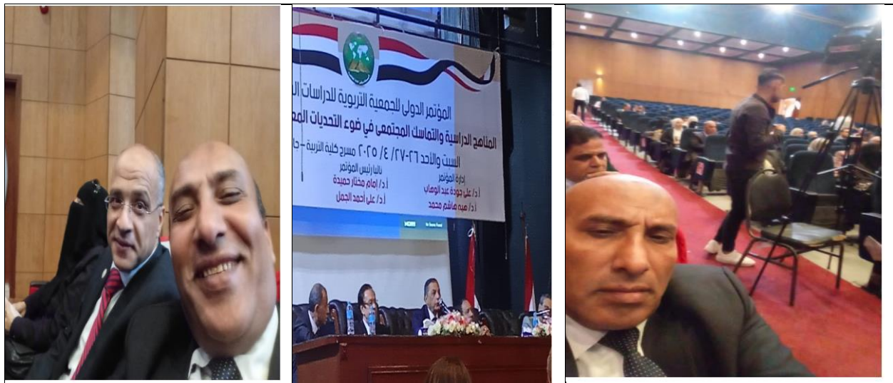
Conferences) Attending and presenting a research paper on social cohesion at the International ) Conference of the Educational Association for Social Studies and the Conference