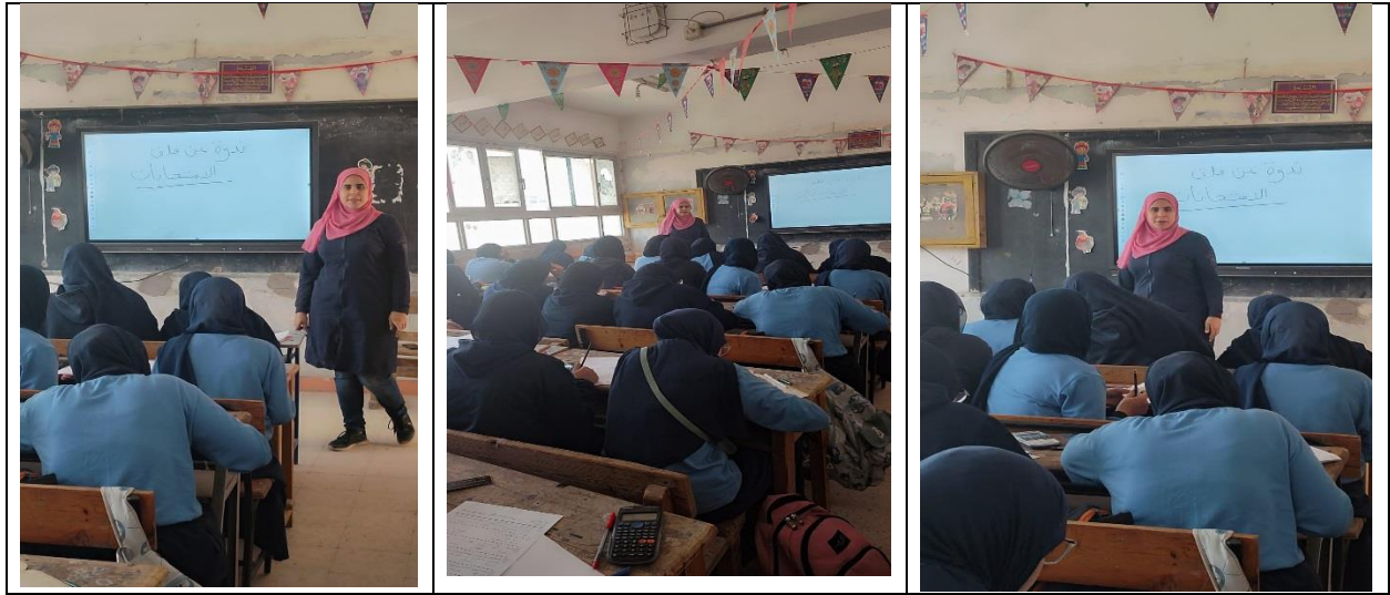
Effectiveness of a seminar entitled "How to Deal with Exam Anxiety"