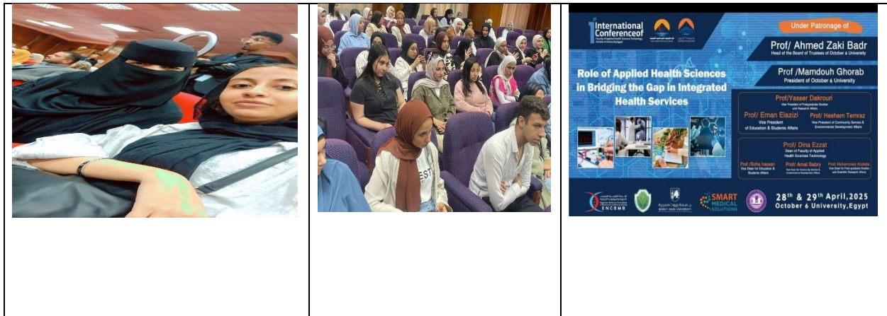
Attending the conference "The Role of Applied Health Sciences in Bridging the Gap in Integrated Health Services"