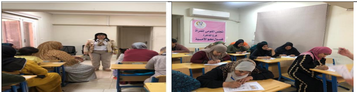
The "Together to Eradicate Illiteracy" initiative continues on Monday, April 28, 2025.