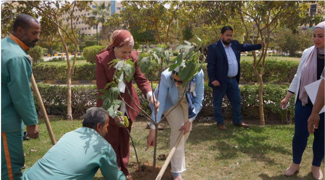
The College of Education participated in a tree planting event on campus