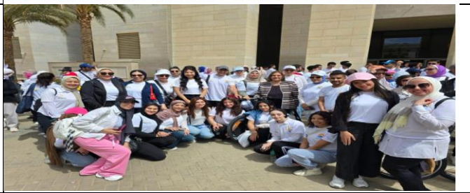
Participation of the Faculty of Education in the Cycling Marathon