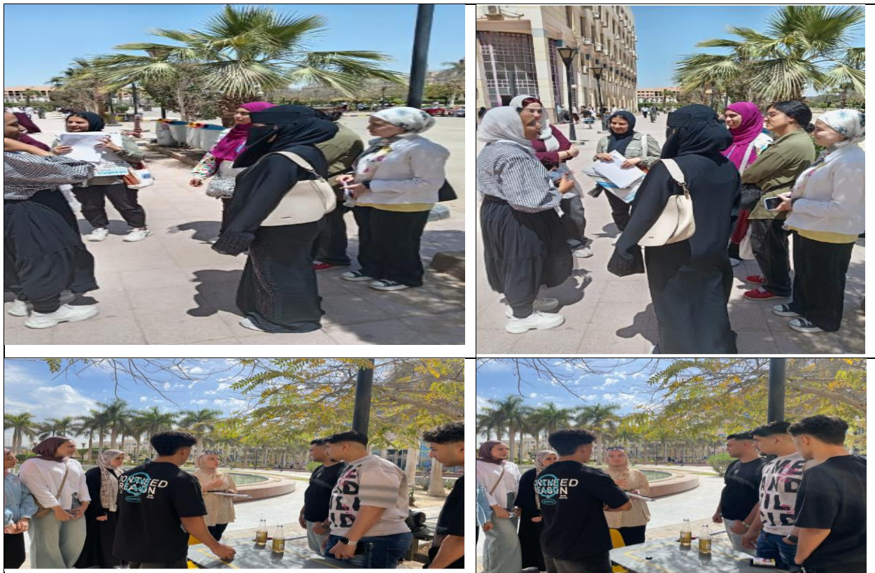
The Faculty of Education participated in Environment Week through a campaign to raise awareness about the carbon footprint