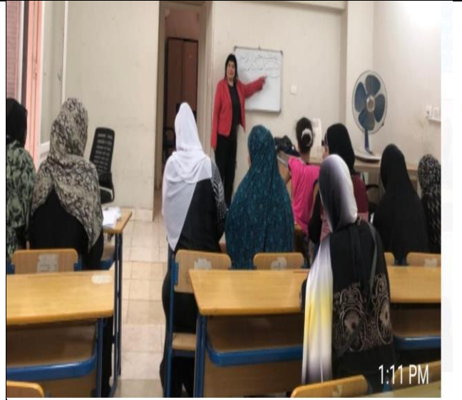
The "Together to Eradicate Illiteracy" initiative continues on Thursday