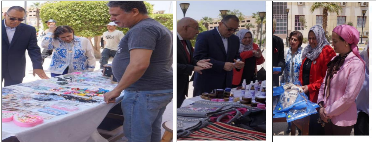
Attending the opening of the Productive Families Exhibition for Alexandria and Cairo Governorates