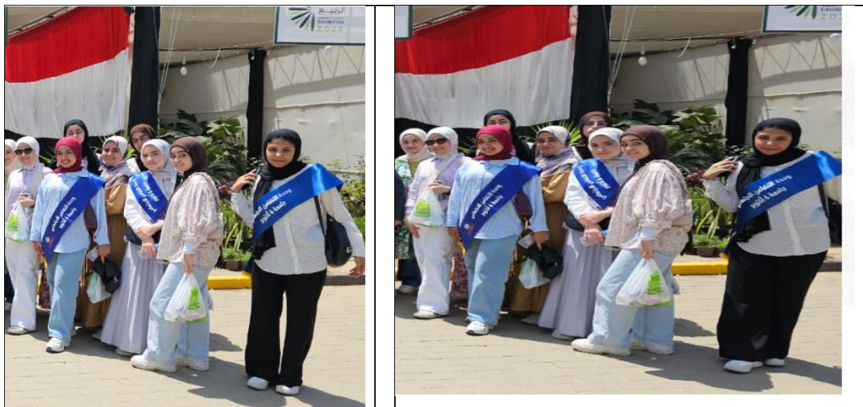
Participation in a visit to the Flower Exhibition at the Agricultural Museum in Dokki