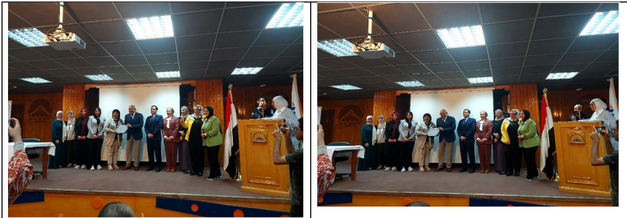
Honoring the Community Service Team from the College of Education on Wednesday, April 23, 2025