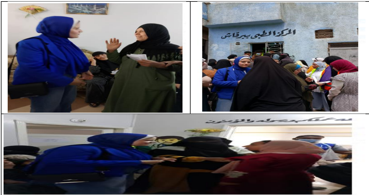
The Faculty of Education participated in the comprehensive development convoy to the village of Barqash, Imbaba Center, Giza Governorate