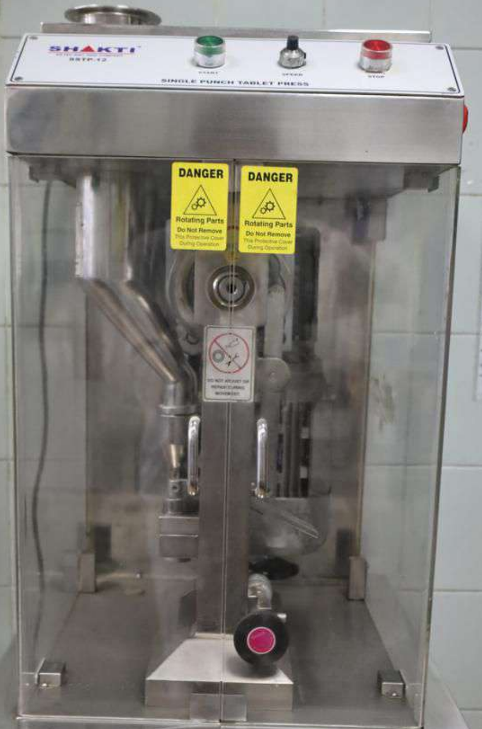
Single Punch Tablet press machine